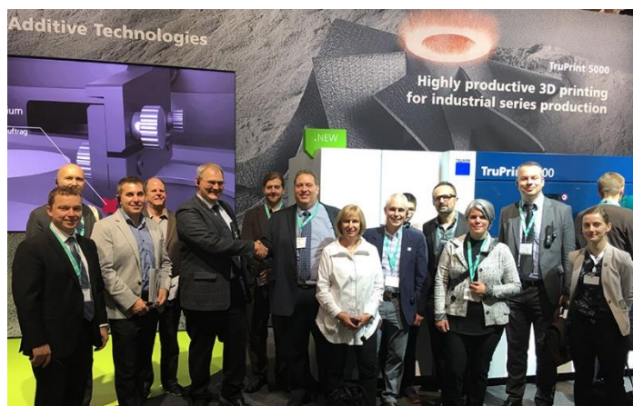
CANADA MAKES DELEGATION VISITING TRUMPF AT FORMNEXT